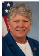
JULIA BROWNLEY CA State Congresswoman

PRESENTED WITH SUPPORT FROM OUR HONORARY CO-CHAIRS