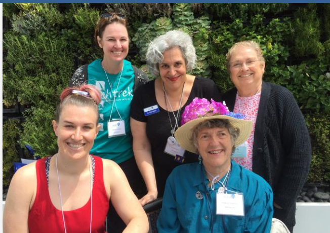
805 Represent! Members from SB/Goleta, Camarillo, Simi and TO Branches