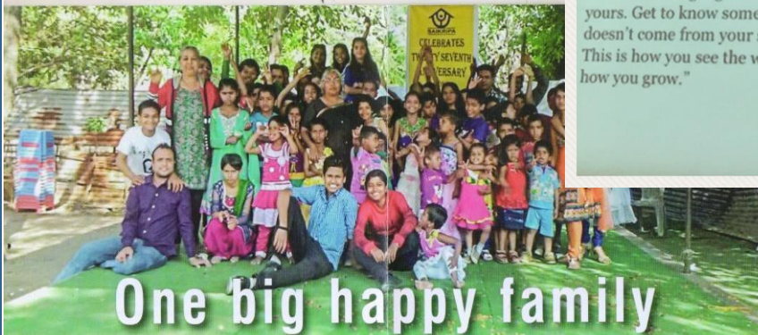
One big happy family