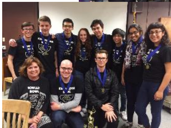
Second Place Winners: Buena High School