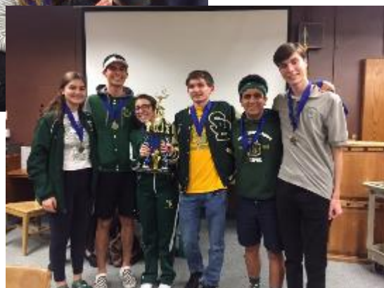
Third Place Winners: St. Bonaventure High School