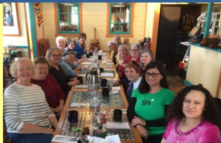
The “before” times

Download Zoom and find helpful video tutorials and other resources to get started. Text Gloria at 805-216-8403 if you have trouble entering the meeting.