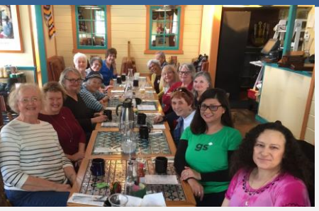
The "before" times

DID YOU KNOW? You can just use the phone feature to call into the audio of the meeting. No computer required (but it is nice to see the faces!) <u>Download Zoom</u> and find helpful videos and other resources to get started. Text Gloria at 805-216-8403 if you have trouble entering the meeting.