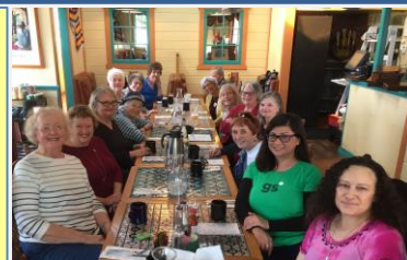
The "before" times

DID YOU KNOW? You can just use the phone feature to call into the audio of the meeting. No computer required (but it is nice to see the faces!) Download Zoom and find helpful videos and other resources to get started. Text Gloria at 805-216-8403 if you have trouble entering the meeting.