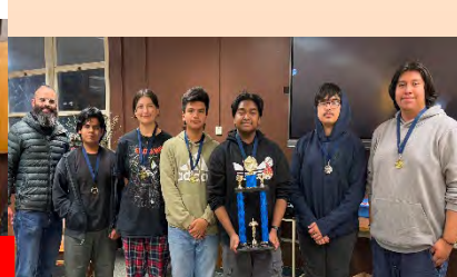
Third Place: Pacifica High School