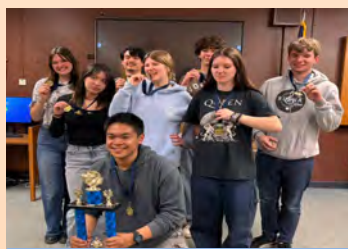
Second Place: Buena High School