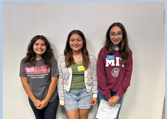
Three of our 2025 Tech Trek Campers who attended the Tech Trek Orientation Meeting in May

Thank you to the Gene Haas Foundation and all our AAUW Members who made financial contributions to make this year's Tech Trek program possible.